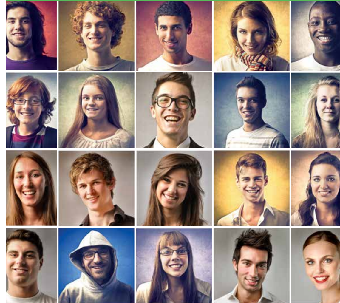
THE CORNWALL COLLEGE GROUP