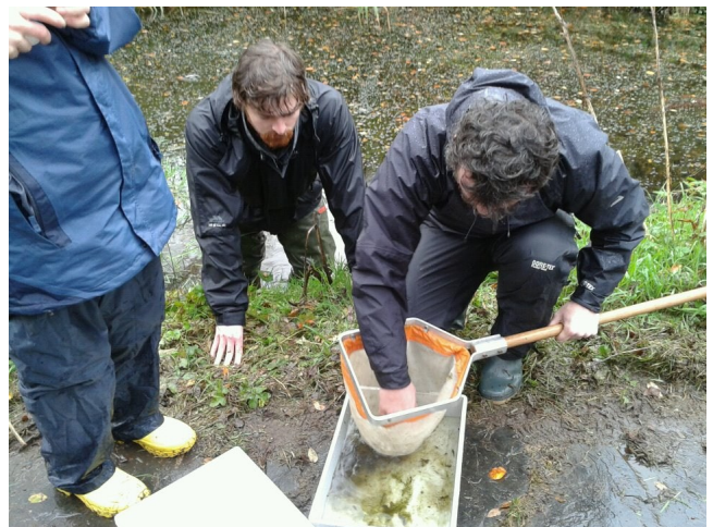
Supporting Defra's Be Plant Wise campaign.

Invertebrate surveys are an on-going aspect of this project and will show an increase in biodiversity as native plants re-establish.