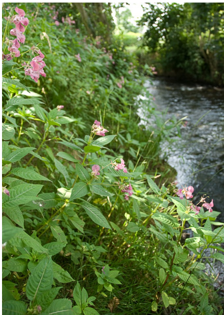
Himalayan balsam invading a river bank.

The National Trust are the latest organization to get involved with the SINNG project. The exciting news is that we will be holding a huge weekend of community events in North Cornwall to help reduce the problem of Himalayan balsam. This plant is highly invasive and is causing huge problems to our native plants as it attracts bees which then aren't pollinating our native plants. It also crowds out native species and spreads at an incredible rate.